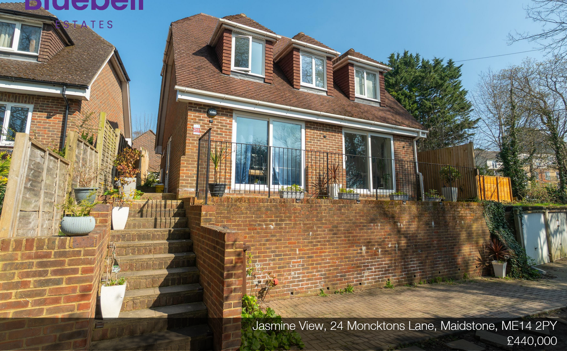
Jasmine View, 24 Moncktons Lane, Maidstone, ME14 2PY £440,000